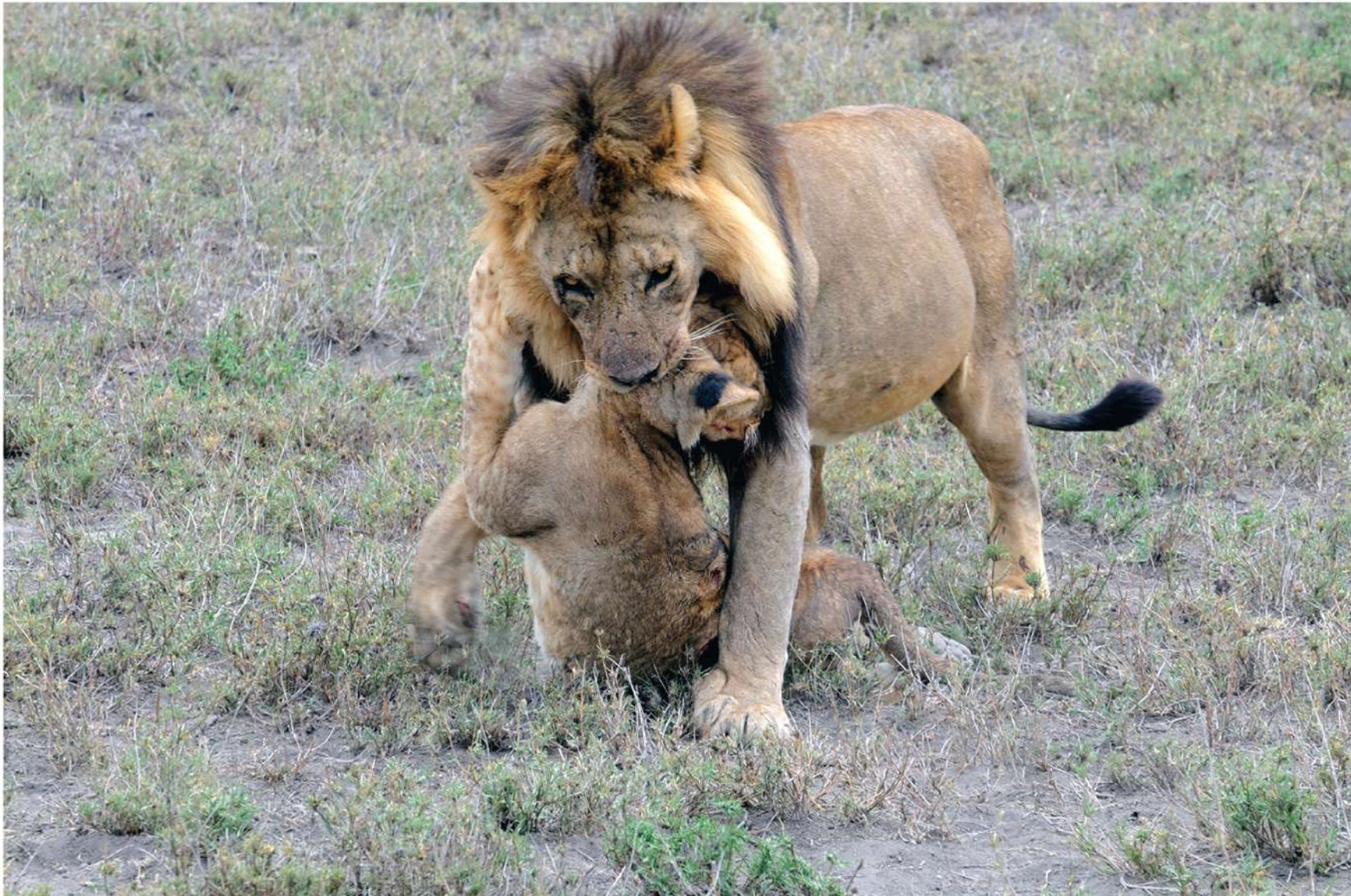
FIGURE 1.2 A male lion ( Panthera leo ) carrying a young lion cub that he has killed