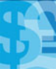
Fig. 1-1: Exports and Imports as a Percentage of U.S. National Income

Exports, imports (percent of U.S. national income)